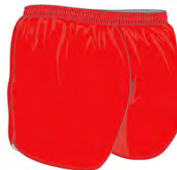
LEFT BACK VIEW