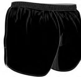
LEFT BACK VIEW