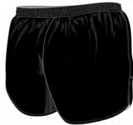
RIGHT BACK VIEW