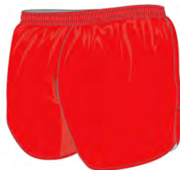
RIGHT BACK VIEW